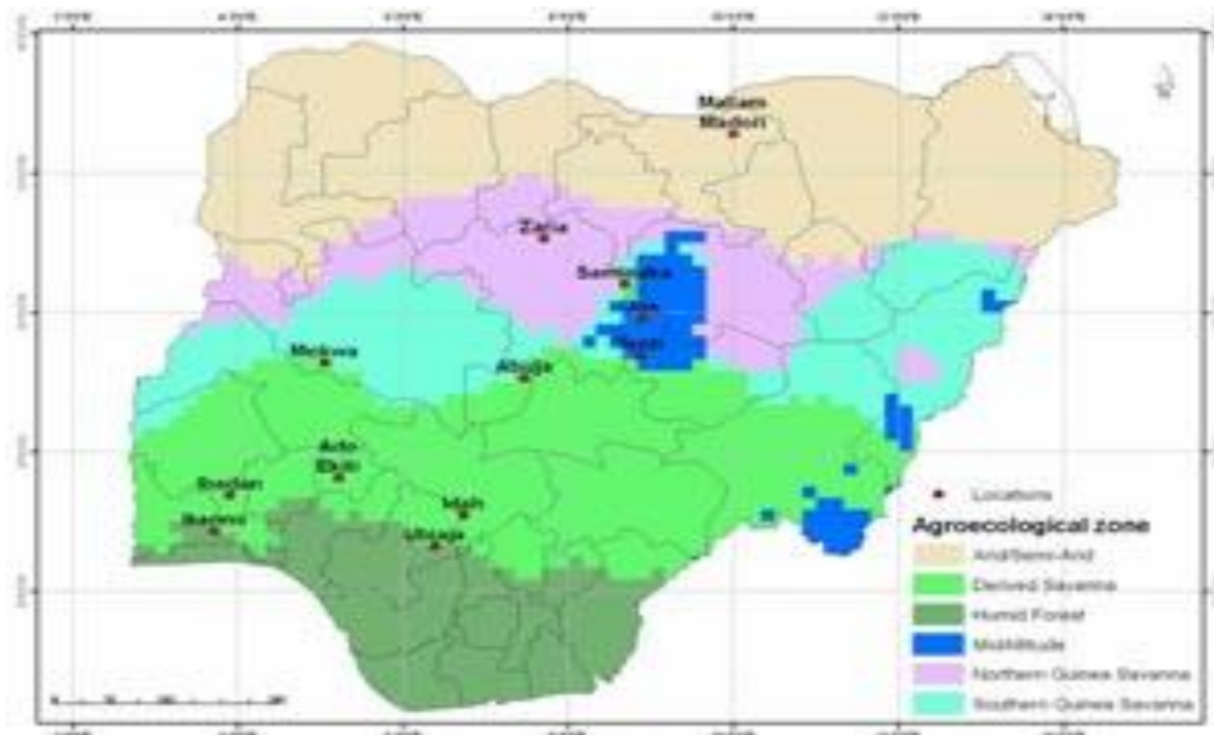
Figure 1: Map showing the Agroecological Areas of Nigeria

Nigeria, along with one-half of the world's countries have portions or all of their land in dryland environments. These lands and their sub-humid margins represent one-third of the earth's surface and are the home to nearly 40 percent of the world's population (White et al. 2002). Africa, including Nigeria is particularly vulnerable to desertification (Penny, 2009). It is here where land and environmental degradation is occurring at alarming rates, often leading to desertification, and threatening the livelihood of more than 1 billion people. Drylands are diverse in terms of their climate, soils, flora, fauna, land use, and people. No